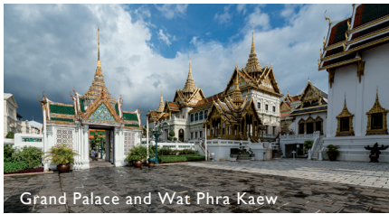
Grand Palace and Wat Phra Kaew