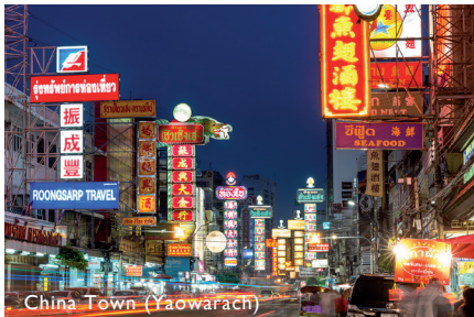
China Town (Yaowarach)