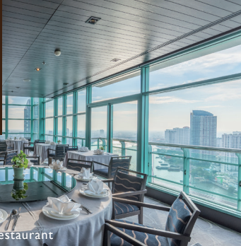
Silver Waves Chinese Restaurant