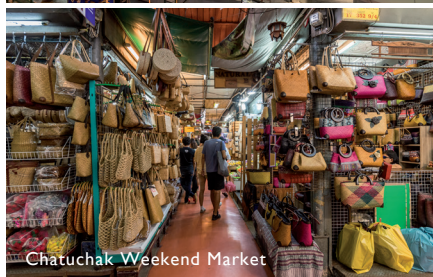
Chatuchak Weekend Market